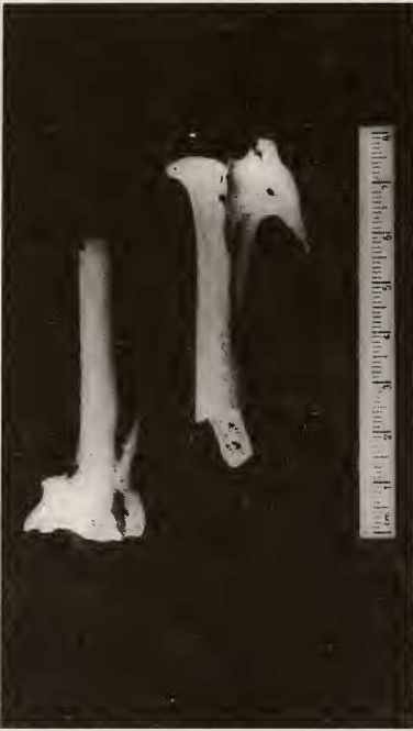
Fig. 5. Carpometacarpal bones: of golden eagle ( Aquila chrysaetos ) from Malak Preslavets (6 000 — 4 000 B.C.) (left) and griffon vulture ( Gyps fulvus ) from Ratiaria (2nd — 4th century A.D.) (right).

enclosure as zoo pets magnificent, large-sized, and fancy feathered birds. Primaries and tail feathers of eagles were used for arrow-endings in the Middle Ages — a habit, survived until 18th century in Bulgaria. There are various data indicating that the Old Bulgarians (Proto-Bulgarians) arrived on the Balkans from Asia, have been transferred the customs of falconery.